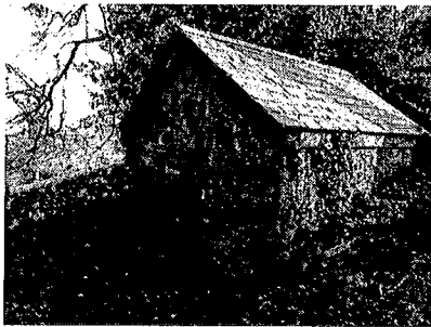
The sexton's hut