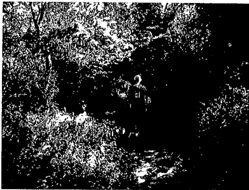
FP13: The Saints' Way near Tredinnick. Two days before, trees fell in a storm but CORMAC were quick to re-open the path.