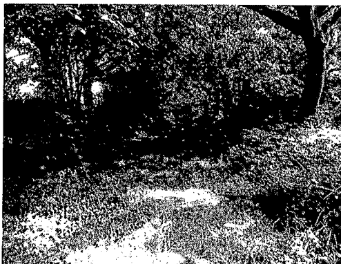
Stepping stones on FP4 near Lockengate