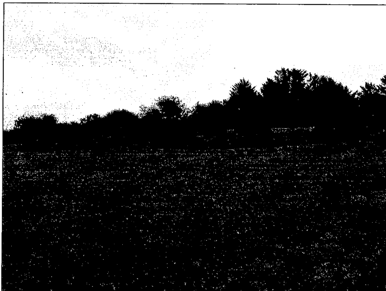
Tregonning Cross after vegetation clearance