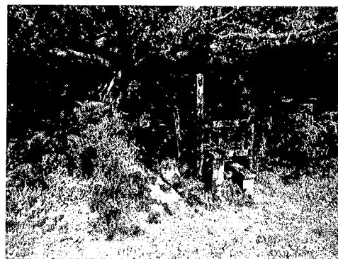
Stile on FP16 linking the Saints' Way and the Valley